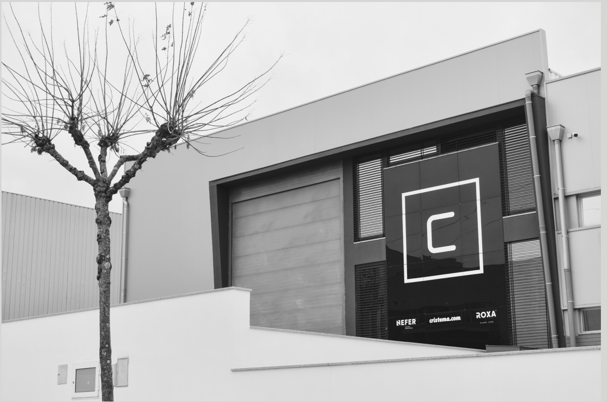
Cristema Company Guimarães, Portugal